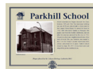
2003 Plaque Parkhill School (1912) 3650 2 St. S.W.