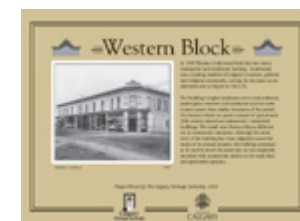
2005 Plaque Western Block (1905) 1001 1 St. S.W.