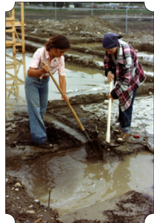
Fort Calgary photo of 1976 Excavation