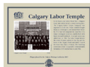
2003 Plaque Calgary Labor Temple (1912) 229 11 Ave. S.E.