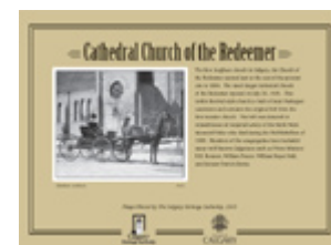
2005 Plaque Cathedral Church of the Redeemer (1905) 218 7 Ave. S.E.